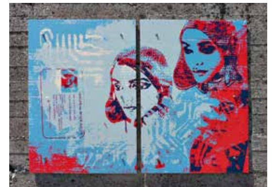
©Barolo Wall | Barolo, Piemonte | Bosch Elettroutensili Profession