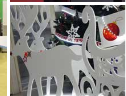
GET INSPIRED: WWW.DISPLAY. 3ACOMPOSITES.COM /INSPIRATION